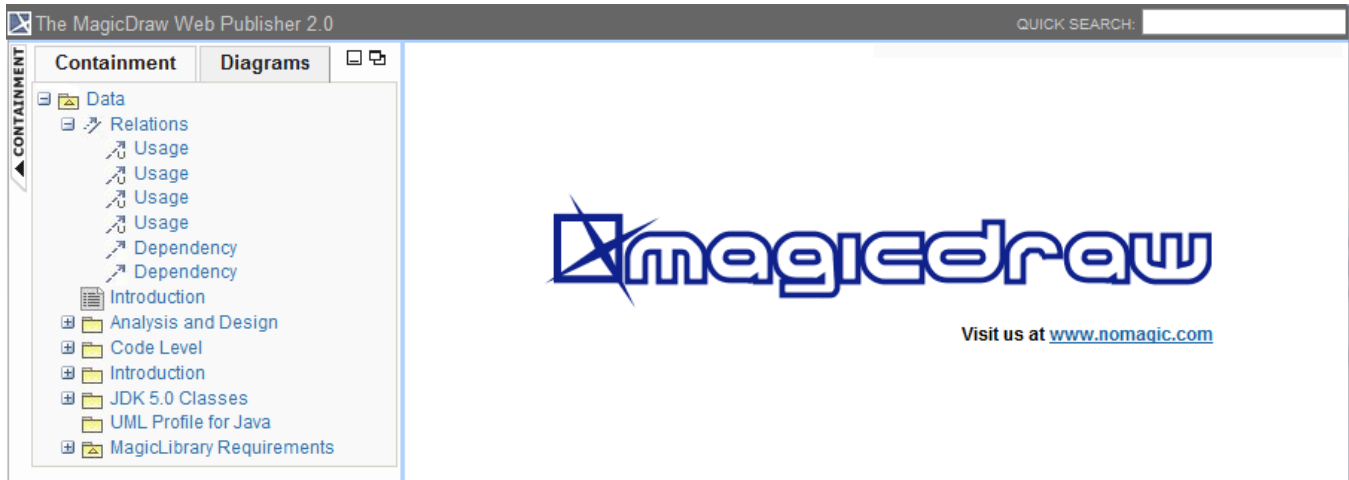
A Web Publisher 2.0 report.

This section describes the features of Web Publisher 2.0, illustrates how to generate a Web Publisher 2.0 report template by using the Library.mdzip sample project, and gives you examples on how to work with each feature.