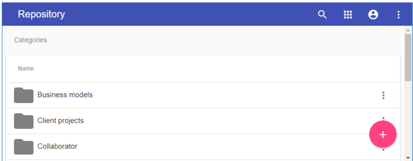
Cameo Collaborator for TWC repository (the Resources plugin).