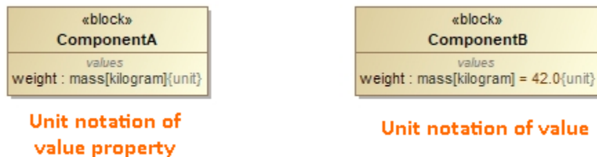
Examples of a unit notation.

Optionally, the unit name or unit symbol could be shown for value properties.