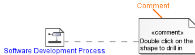
Example of a comment.

A Comment is a UML element used to specify various remarks of an element in the model. In the diagram palette, under Common , the Comment command appears under the Note command. You can display text in the Comment as plain or HTML text.